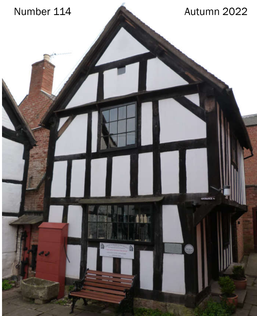
Butcher Row House Museum

Ledbury & District Civic Society “Looking After Ledbury...”